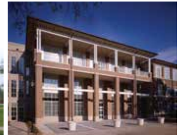
Albro-Falconer-Manley Science Center