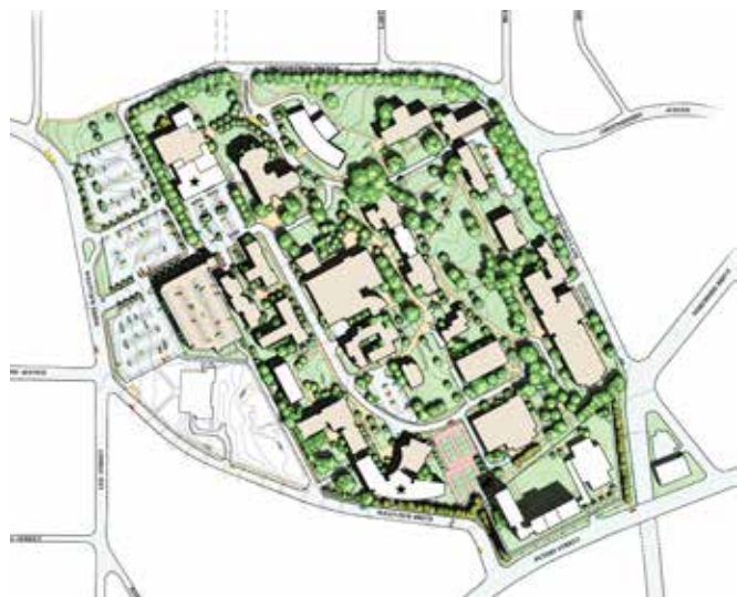
Illustrative Drawing: Campus Master Plan