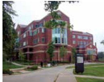
Camille Olivia Hanks Cosby Academic Center

An architect has been selected and the project is currently in early stages of design.